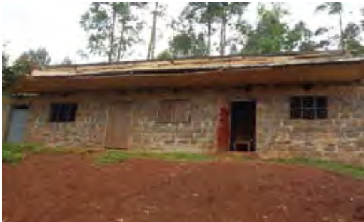
A proposed clinic in Kiserian upper Matasia in Ngong, Kenya.