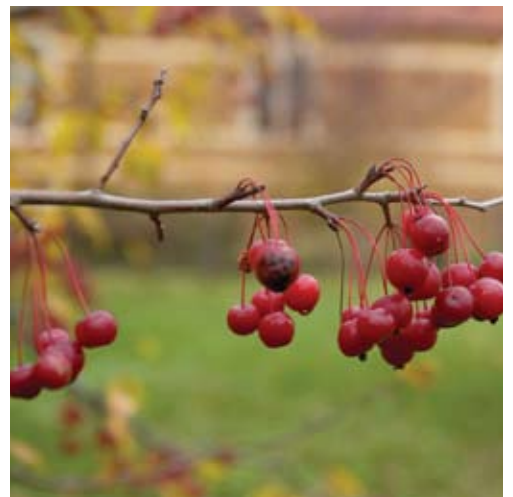
Baker campus during the fall.