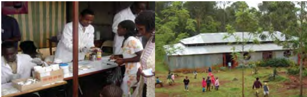
Left: Patients' prescriptions are filled for free following a consultation with volunteer physicians. Right: Children play on the grounds of a proposed clinic, currently used for worship services.

"I hope I can be an example to them," she said. 🍁