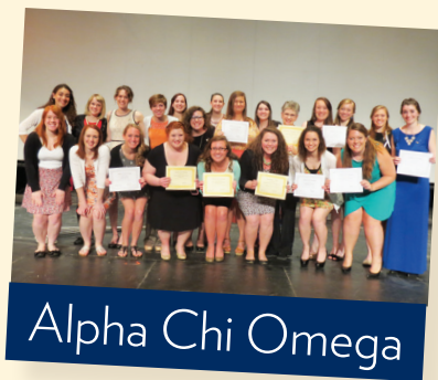
Alpha Chi Omega