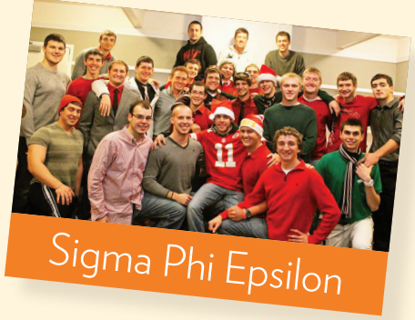
Sigma Phi Epsilon