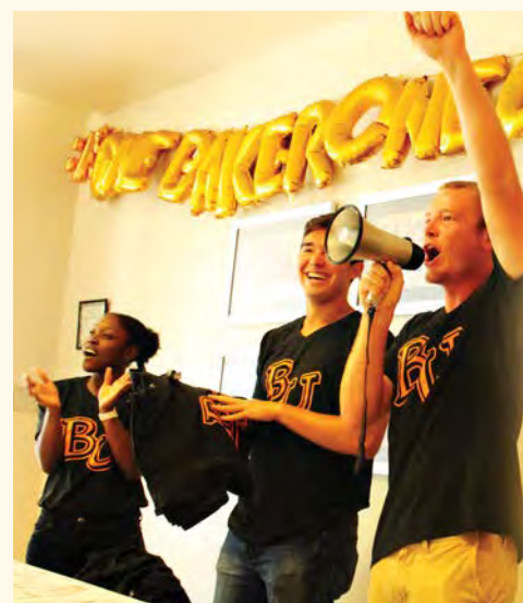
Day of Giving celebration among teams.

On September 19, the Baker community came together for One Baker, One Goal, 24 hours of online giving and paying it forward for the Baker Fund for Scholarships. The inau-