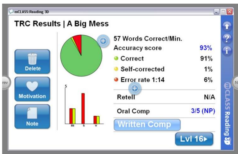
Figure 3. Data Report.

Accuracy ratings fall into one of three categories: below 90 % is too hard for the child and is in the frustrational level, 90 % to 94 % is in the instructional level, meaning that reading of the text requires support from the teacher, 95 % to 100% is too easy for the child or falls in the child's independent reading level, meaning that they can read the book independently without teacher support (Fountas & Pinnell, 1996). If the child completes the reading accuracy at 90% or better along with an average of 2.5 or more on the oral comprehension portion, the child has passed that level. The teacher may then go on to the next level and repeat the same steps. Once the child has not passed a level, a guided reading level is established. For example, if the teacher selected a level G book and the child has passed the level G, the teacher would then move on to a level H book. If the child does not pass the level H book, the child's score would result in a level G.