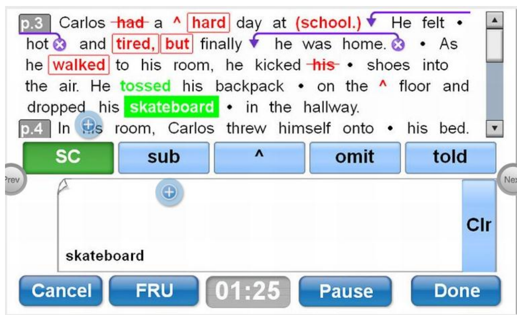
Figure 1. Running Record.